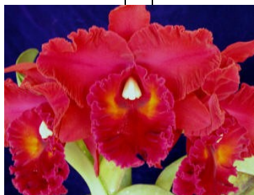
Blc. Owen Holmes 'Mendenhall'

Our Holiday and Awards Banquet this year will again be held at ODU on December 13 th in our usual meeting place in the Webb Center Cafeteria. Remember we will NOT be meeting on our usual first Sunday date due to a scheduling conflict. The party will begin with appetizers and a cash bar at 5:30 PM followed by a wonderful buffet dinner (if last year's party was any indication) and then the presentation of Show Table Awards and a review of the plants brought in for display. The cost to the members will be $25.00 per person with TOS contributing the balance. You may