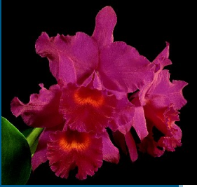
C. Penang 'Black Caesar'