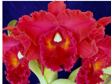
Blc. Owen Holmes 'Mendenhall'