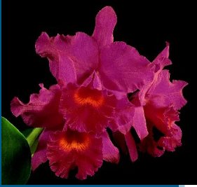
C. Penang 'Black Caesar'

Last month I saw a picture of a beautiful Cynodes in a magazine and when I searched for a grower Pine Ridge Orchids popped up. I had not heard of them before but decided to see if they had the Cynode I was interested in available for purchase. The owner, Terry Glancy, was very helpful and knowledgeable. I ended up purchasing several plants and when they arrived I was very surprised and pleased at the high quality of the plants. They arrived very well packed and in perfect condition. I recommend that you go to his website at www.pineridgeorchids.com and give them a try. If you do purchase anything from Terry please let me know how the transaction went. I like to keep our files up-to-date on members good and bad experiences with different vendors. If you have a vendor that you'd like to comment on please let me know. Your fellow members will appreciate it!