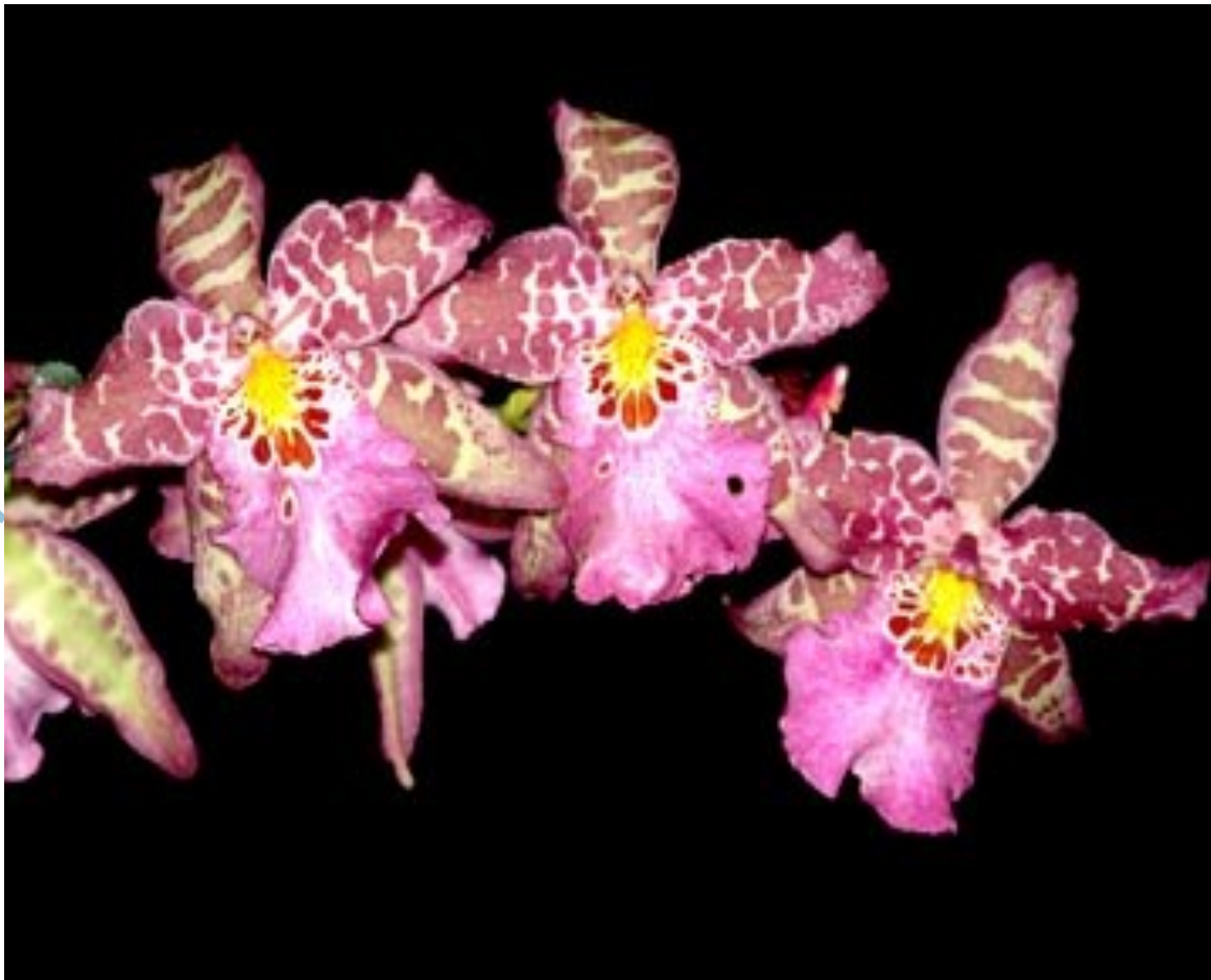
The Bud Blast