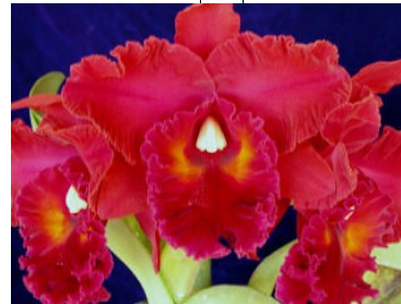
Blc. Owen Holmes 'Mendenhall'