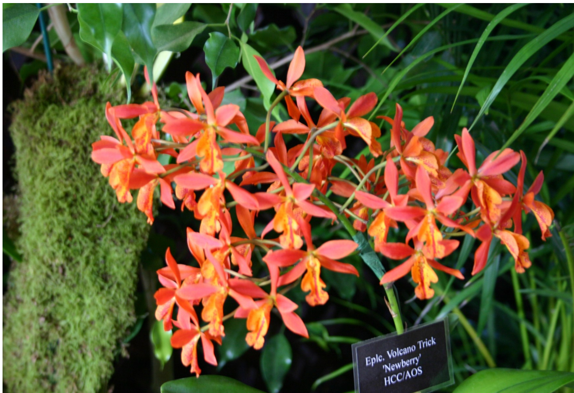
The Bud Blast